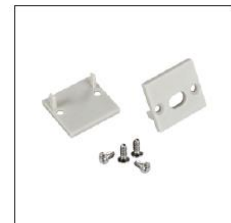
End caps+screws 1 with hole+ 1 without hole