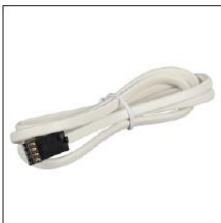
Power input cable