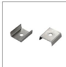
Metal mounting clip